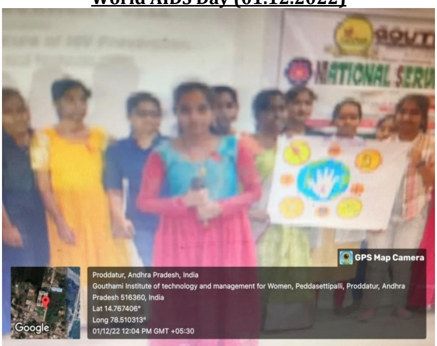
Group Photo World Aids Day

Gouthami Institute Of Technology & Management For Women has conducted the awareness program on WORLD AIDS DAY at Peddasetti Palli Village. The day is an opportunity for public and private partners to spread awareness about the status of the pandemic and encourage progress in HIV/AIDS prevention, treatment and care around the world. Today, scientific advances have been made in HIV treatment and there are laws to protect people living with HIV. People do not know the facts about how to protect themselves and others. Stigma and discrimination remain a reality for many of them living with the condition.