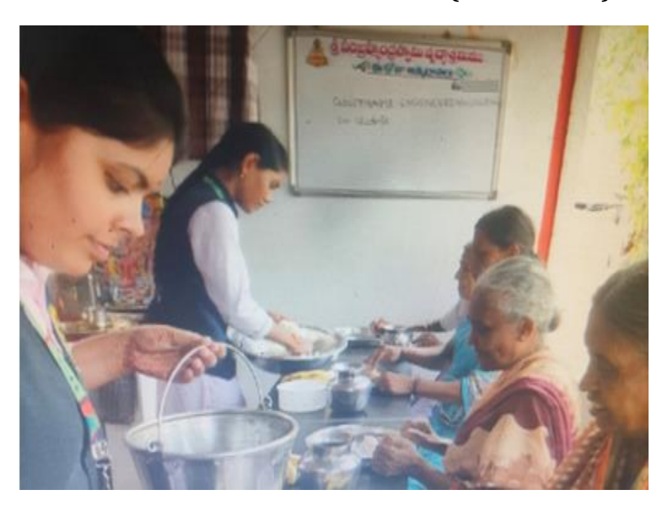
Group Photo Cotinuing Core Community

Gouthami Institute Of Technology & Management For Women has conducted a Continuing core community. In this program many of the students are participated and faculties..In this program many of the students are participated and faculties.