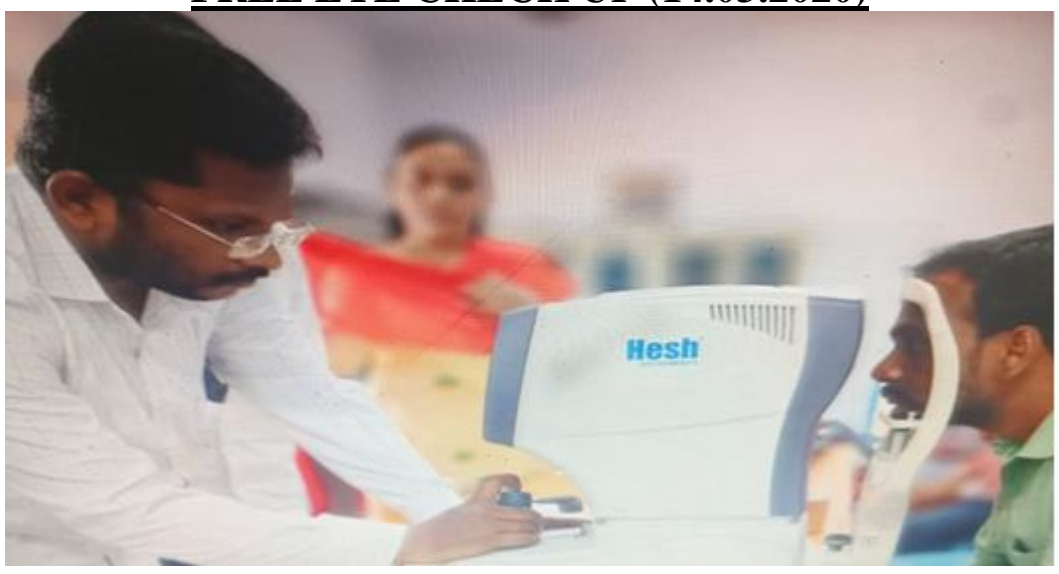
Eye Check Up

Gouthami Institute Of Technology & Management For Women has organized FREE EYE CHECKUP CAMPAIGN in collaboration with Lions Club at Peddasetti palli(v) to create awareness among the people regarding eye related problems. People were examined for common eye problems, near and far vision and to create an eye care delivery channel that provides preventive, curative and promote eye care services in a sustainable way has conducted a Eye Check up. In this program many of the students are participated.